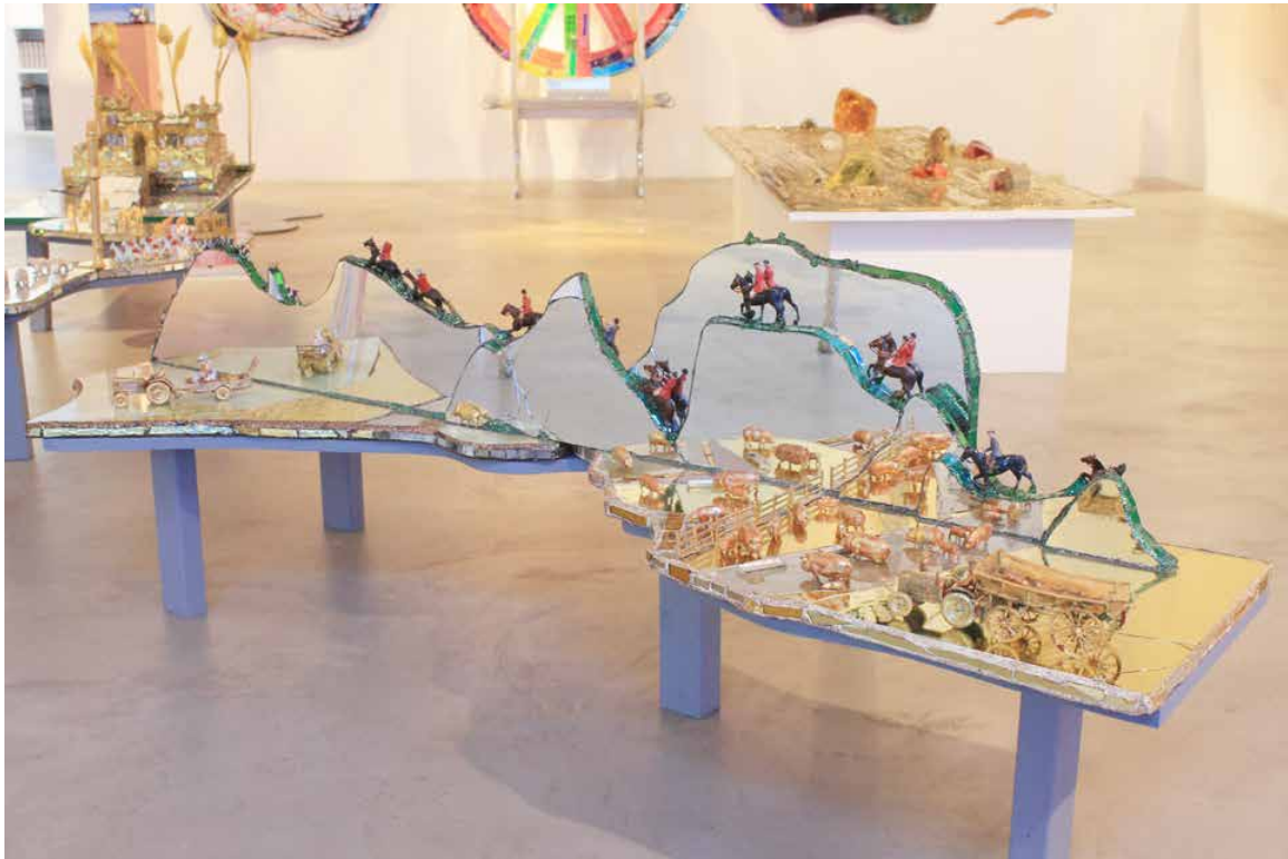
Childhood, 2008, mixed media , Various Sizes, Total : 3 pieces