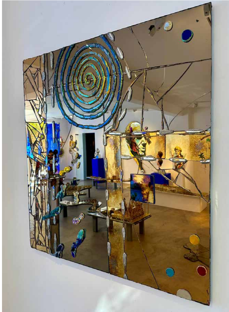
Brian Eno's Neroli, 1999, mixed media, 120 x 120 cm | 47 1/4 x 47 1/4 in