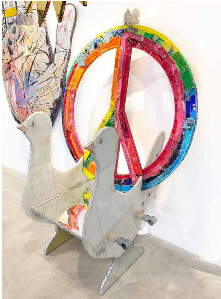
AMW Peace Throne, 2018, mixed media 190 x 120 x 100 cm | 74 3/4 x 47 1/4 x 39 3/8 in