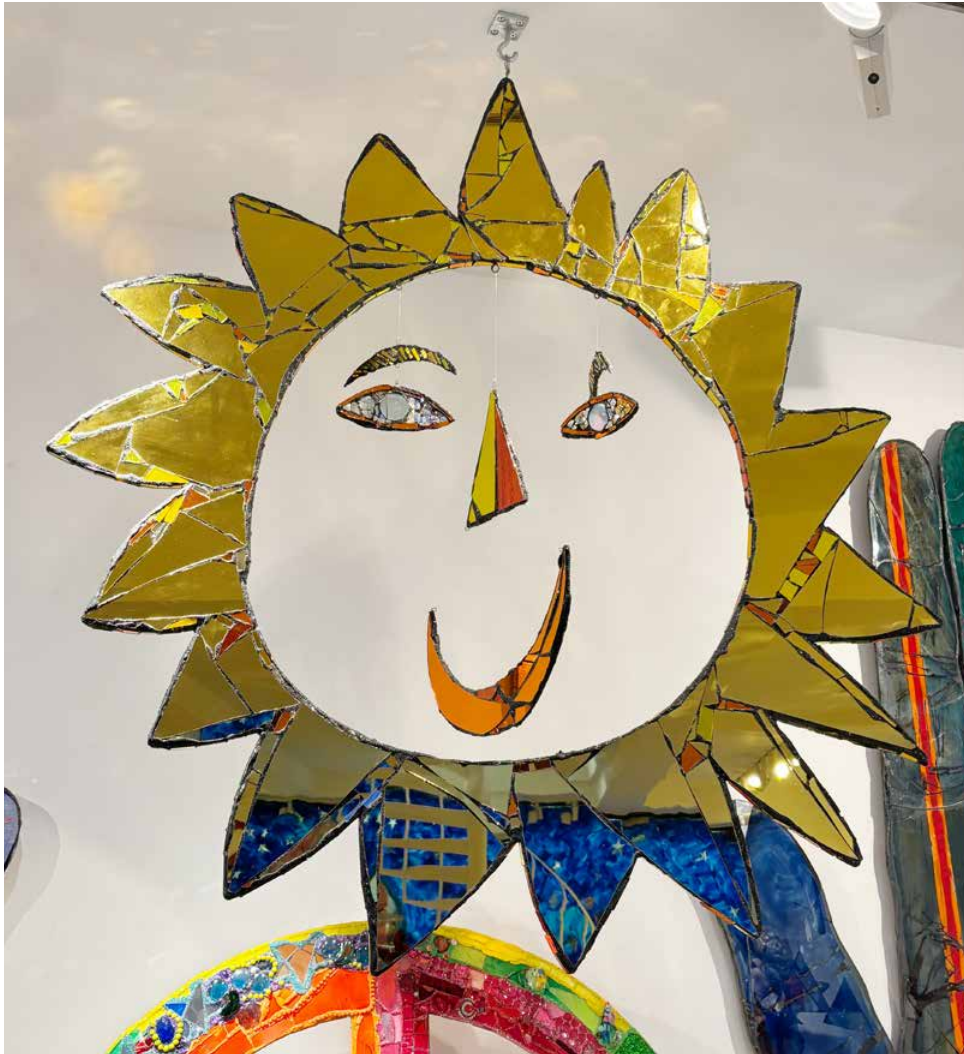
Sun of Smiles , 1997, Mixed Media, 120 x 120 cm | 47 1/4 x 47 1/4 in