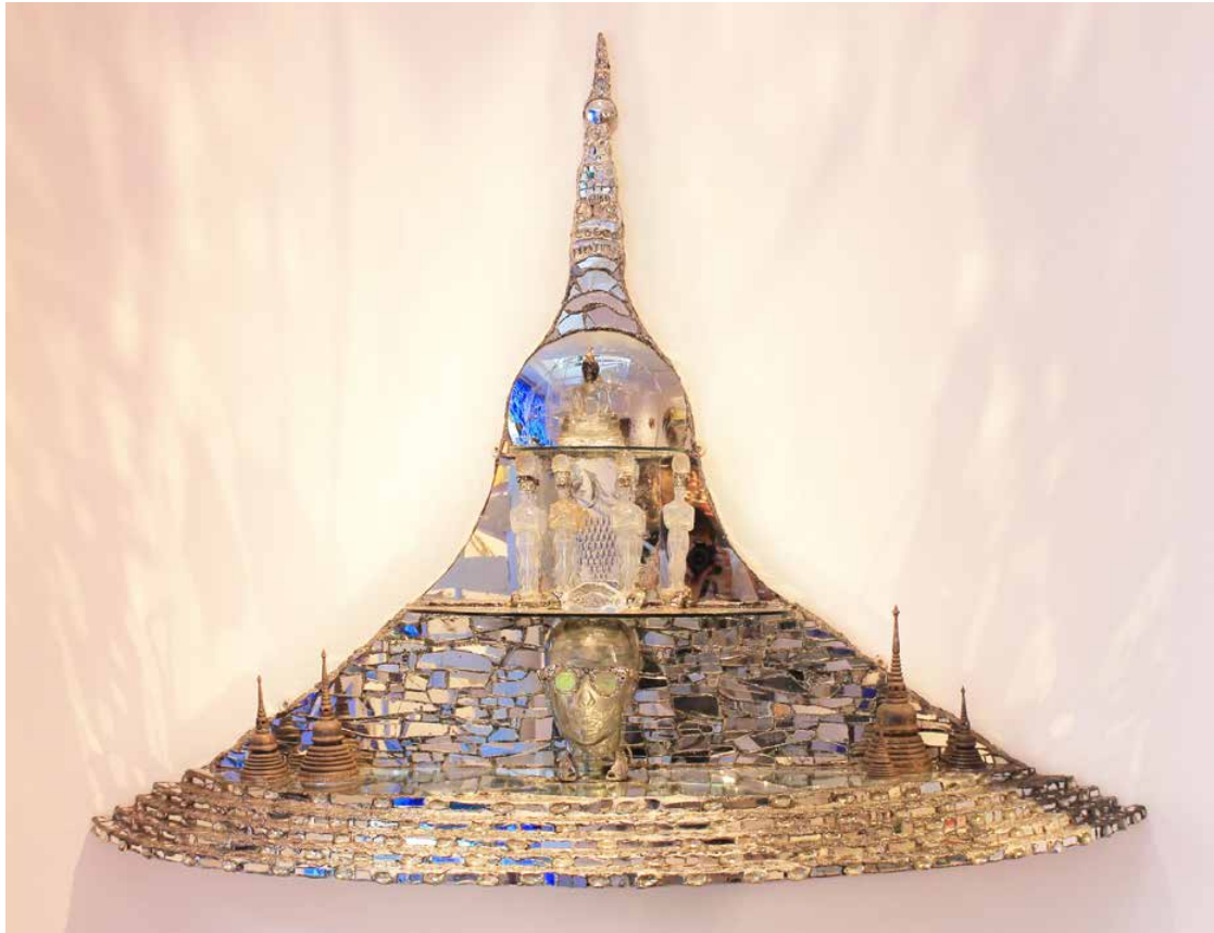
Eventuality, 1997, mixed media, 150 x 200 cm | 59 x 78 3/4 in