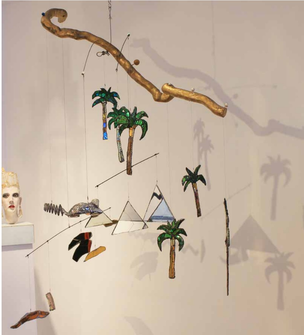
Egypt Revisited 2 , 2000, mixed media, 150 x 150 x 150 cm | 59 x 59 x 59 in