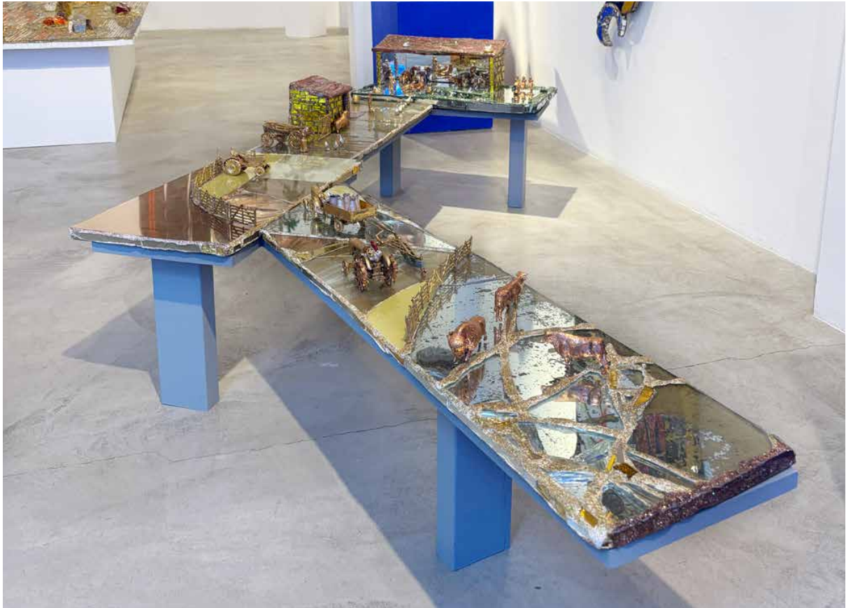
Childhood, 2008, mixed media , Various Sizes, Total : 3 pieces