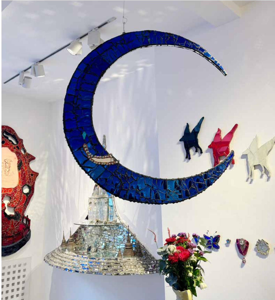
Moon of Smiles , 1997, Mixed Media, 100 x 100 cm | 39 3/8 x 39 3/8 in