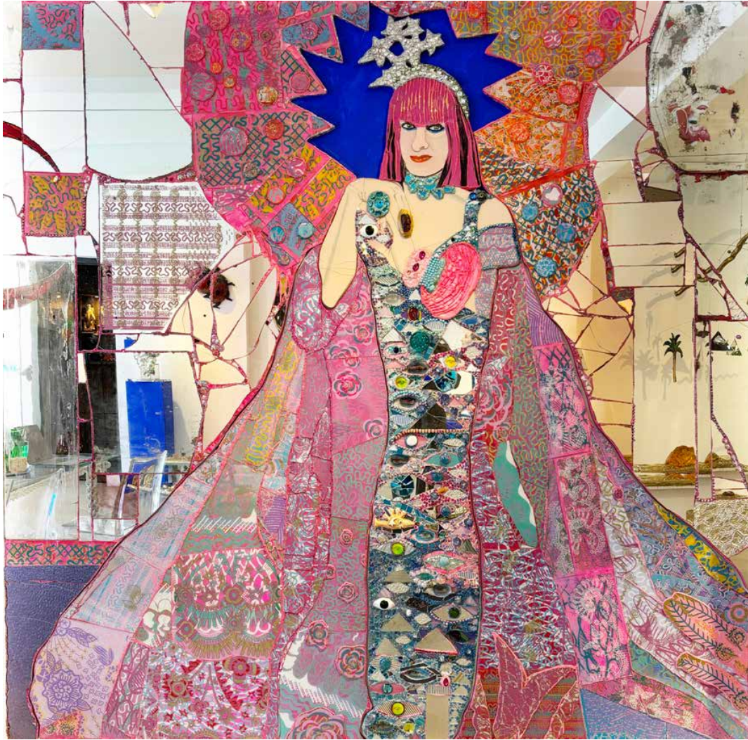
Zandra (Klimt), 2008, mixed media, 245 x 247 cm | 96 1/2 x 97 1/4 in