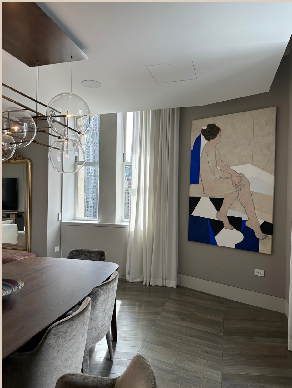
Installation view of Olimpia Malipiera