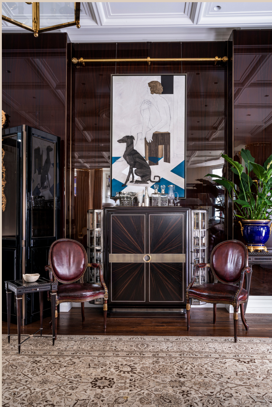
Installation view from Oro Bianco for World of Interiors