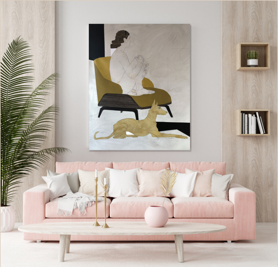
Installation view of Concurrence