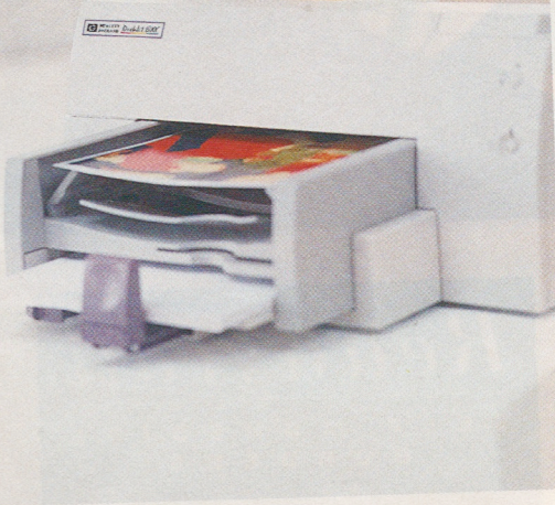
You can scan colour pictures via Pavilion's unique PhotoDrive and print them off in full technicolour on Hewlett-Packard's DeskJet 690C Printer

The Pavilion PC range, priced from £1,299, is available at leading computer retail stores, including Byte, PC World and John Lewis.