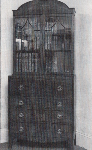
George III mahogany Secretaire Bookcase.