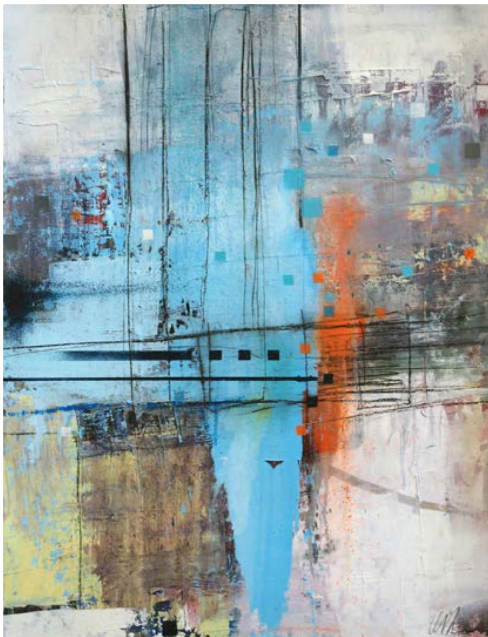
Paper 27 oil and spray on paper 31 1/8" x 24 3/4"