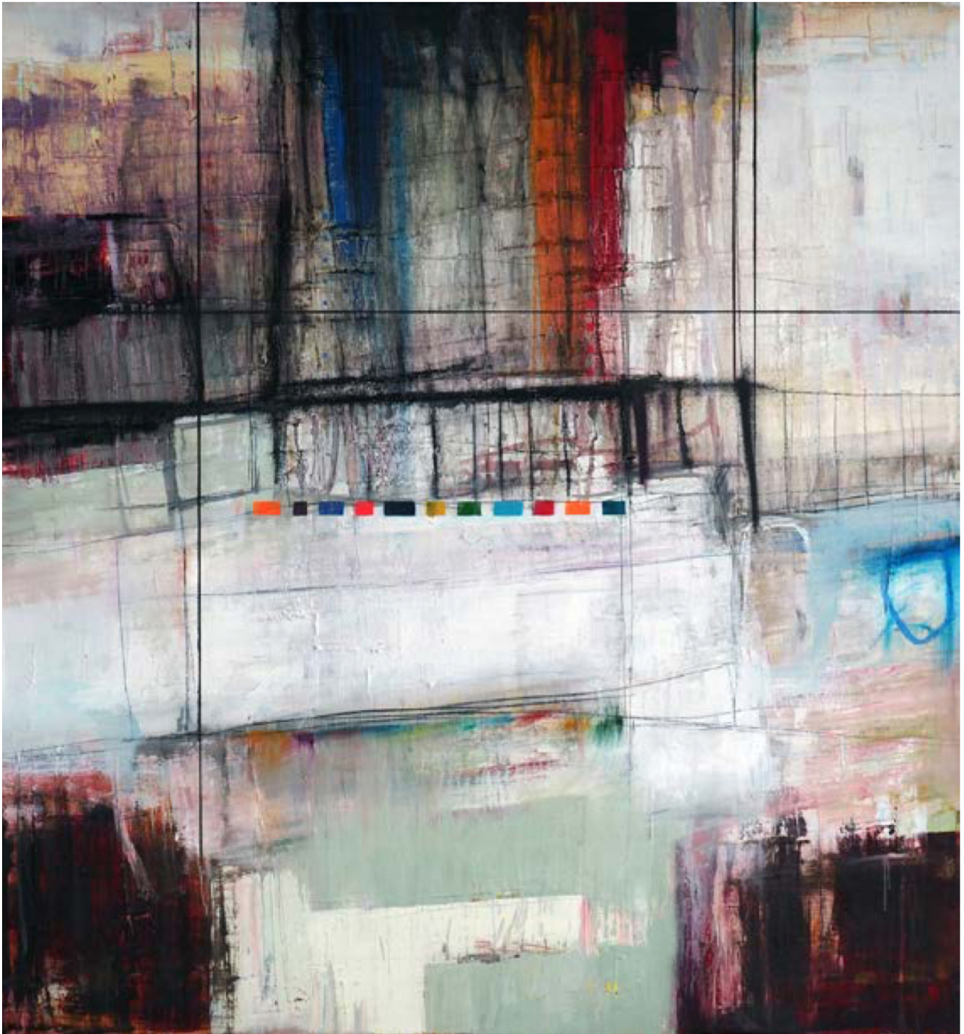
Infiltrated M oil and spray on linen 59 1/8" x 59 1/8"