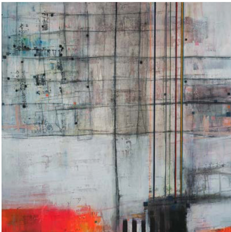
Limbo E oil and spray on linen 47 1/4" x 47 1/4"

"My work is abstract and expressive, which means that I don't use sketches or other kinds of preparatory work before starting on a painting. My paintings develop as I am painting, and I work very spontaneously and intuitively."