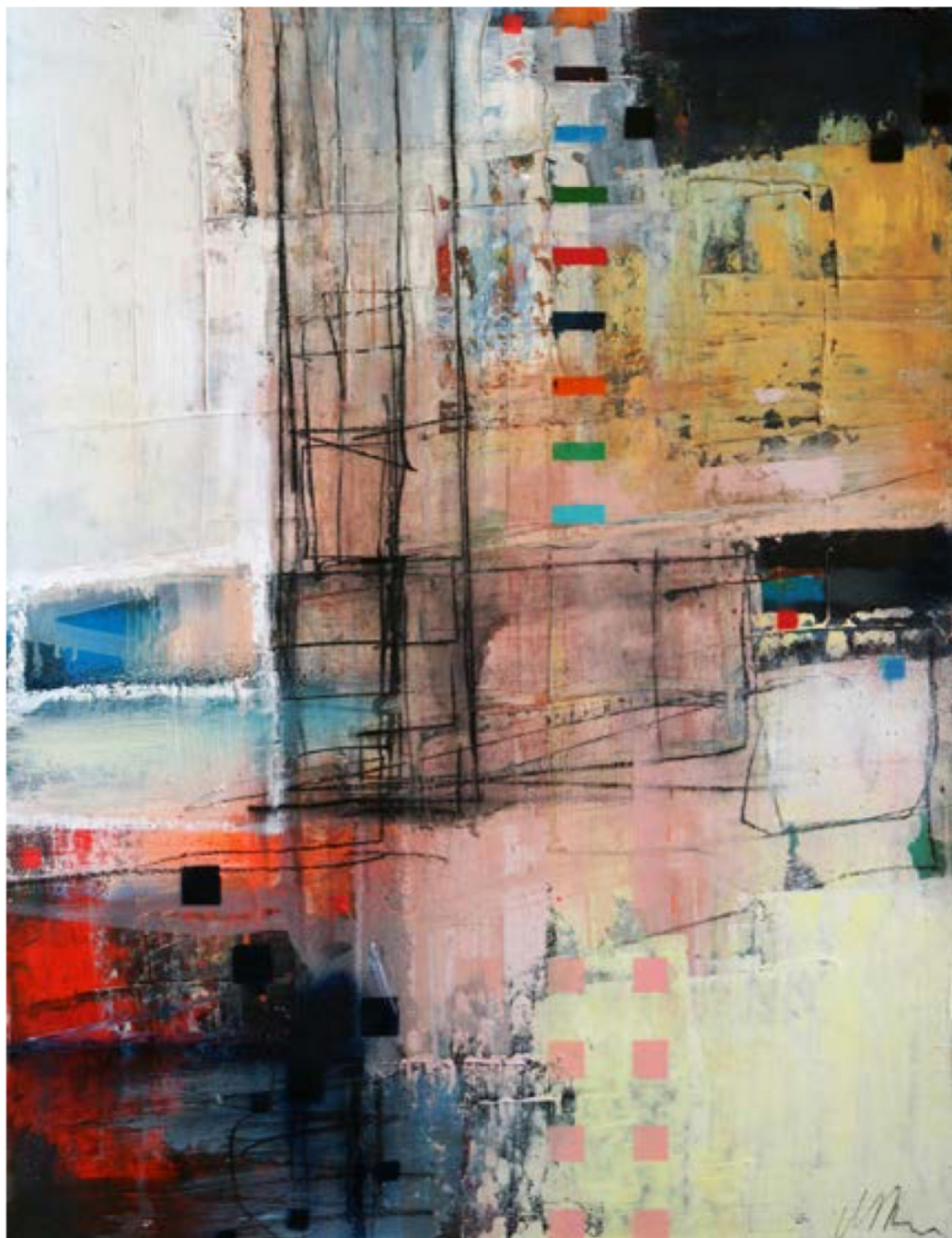
Paper 29 oil and spray on paper 31 1/8" x 24 3/4"