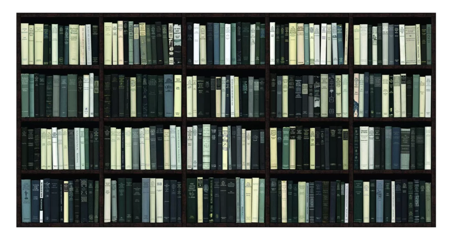
Shades of grey: The Truth in Black and White with Some Grey Areas I Phil Shaw/REBECCA HOSSACK GALLERY

"As a result, I see most beliefs (even scientific ones) as a form of dogma. And I enjoy poking fun at dogma – wherever it lurks. The book titles are all absolutely genuine (with the exception of the Fiction and Friction series). I wouldn't have done the prints otherwise. They all appear in the British Library Catalogue."