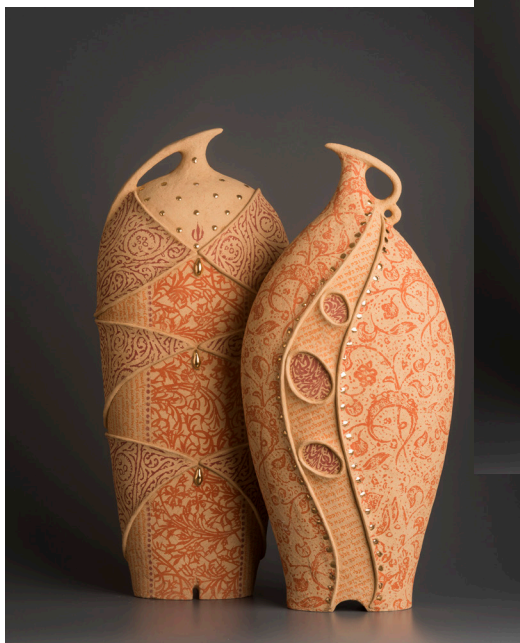
(Clockwise from the top): Calamo V & Arista V , 2019, hand-built, glazed and stencilled earthenware, 52 x 20 x 15 cm, Calamo IV , 2018, hand-built, glazed and stencilled earthenware, 50 x 20 x 15 cm, Calamo I & Filia I , 2019, hand-built, glazed and stencilled earthenware, 52 x 20 x 15