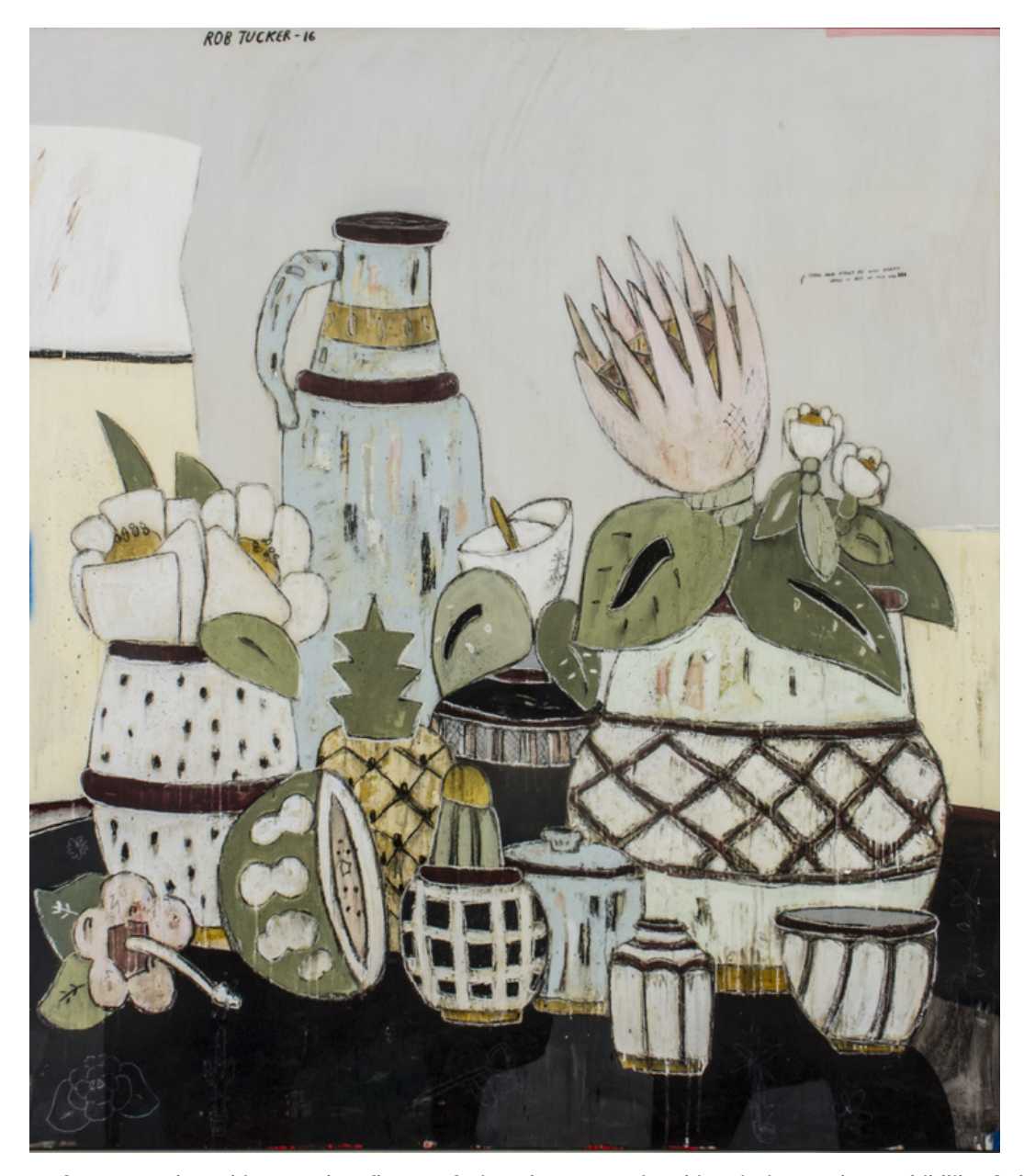
Creating images from everyday subjects such as flowers, fruit and tea cups, gives his painting an almost childlike, 2-dimensional perspective; And it's only when you look more closely at the unexpected, stripped back fragments, that you can see the depth beyond the shadows and his work becomes more imaginative and exquisitely detailed.

Creating thick mantles of graphic, resin and oil paint, allows him to embrace everyday subject matter without contradiction, which he rounds off with surfboard resin for a sculpted, lacquered sheen.