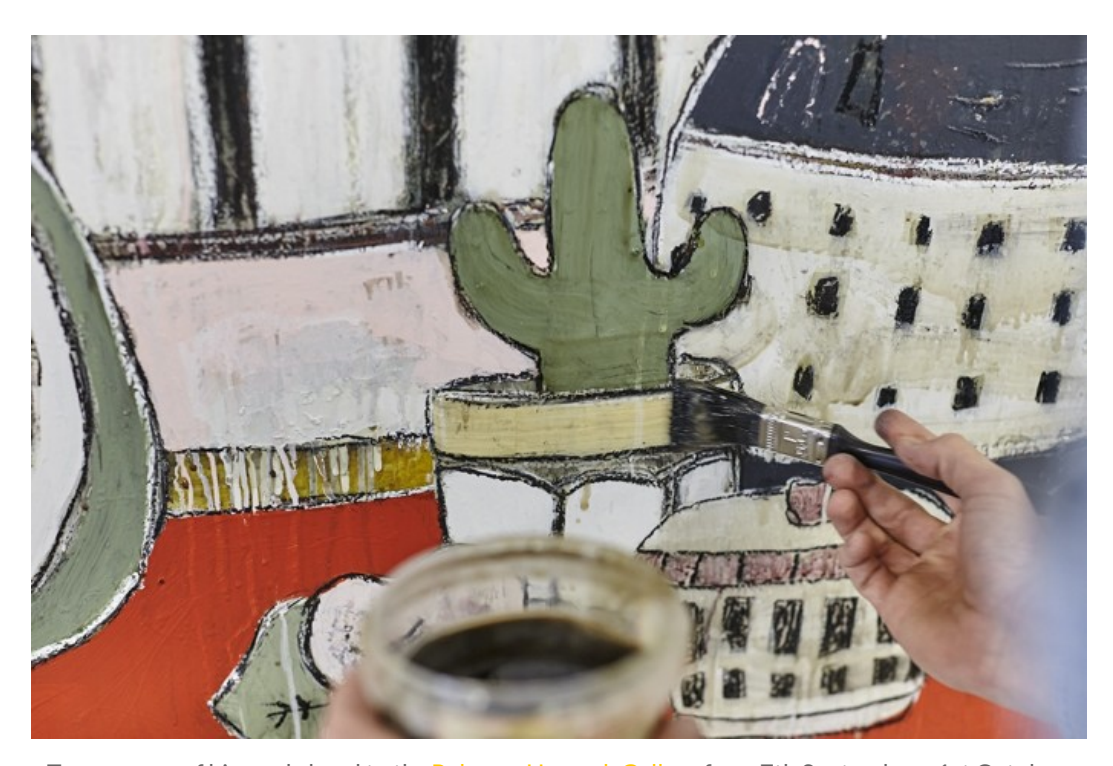
To see \ more \ of \ his \ work, head \ to \ the \ {\color{red}Rebecca \ Hossack \ Gallery} \ from \ 7th \ September - 1st \ October.