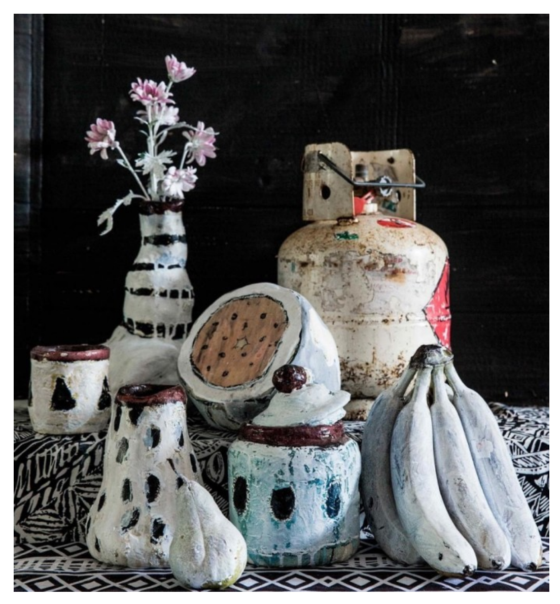
Tucker is obviously fascinated by the relationship between space and shape, and in simply constructing the outline of an object, the formation becomes more abstract and less real.